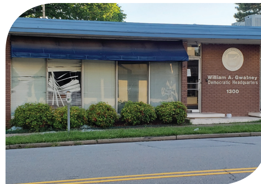
The Democratic Headquarters in downtown Little Rock was damaged during protests on the night of May 31.

And now let me tell you a little more about that good news—and how you can be part of our work.