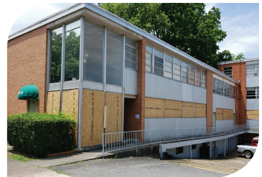
Our office building immediately behind the Democratic Headquarters.

414 S. Pulaski St., Suite 2 • Little Rock, AR 72201 • 501-375-7000 • info@familycouncil.org