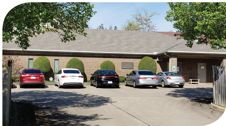
Family Council staff members were able to provide photos like this one to state officials earlier this spring.