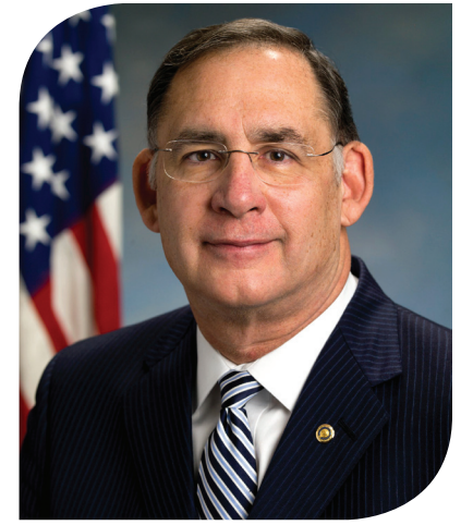
U.S. Senator John Boozman (R-AR) serves on the Veteran's Affairs Committee and is one of nine senators serving on the Commission on Security and Cooperation in Europe (Helsinki Commission).

The free world has an obligation to continue to stand in solidarity with the people of Hong Kong as they fight to defend their basic democratic rights.