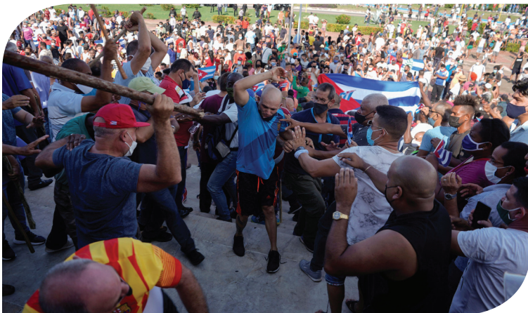
Protesters clash with plain-clothes police in Havana, Cuba on July 11, 2021.