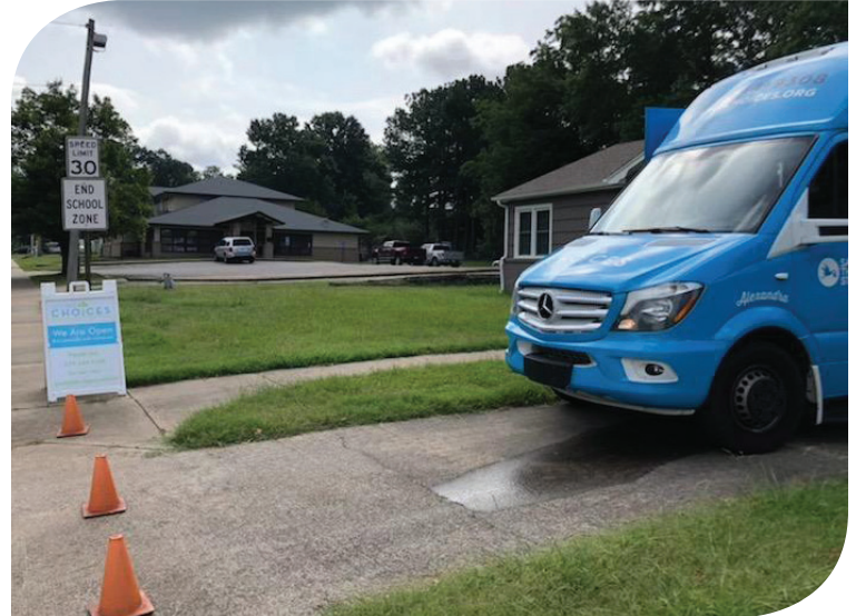
Above: A mobile pregnancy resource unit sits just a short walk from the front door of a facility that Planned Parenthood recently acquired in Rogers.

We enjoyed a reprieve when Planned Parenthood left Northwest Arkansas in 2019. They may be back, but pro-lifers are still standing strong against abortion and working hard to save unborn children in Arkansas.