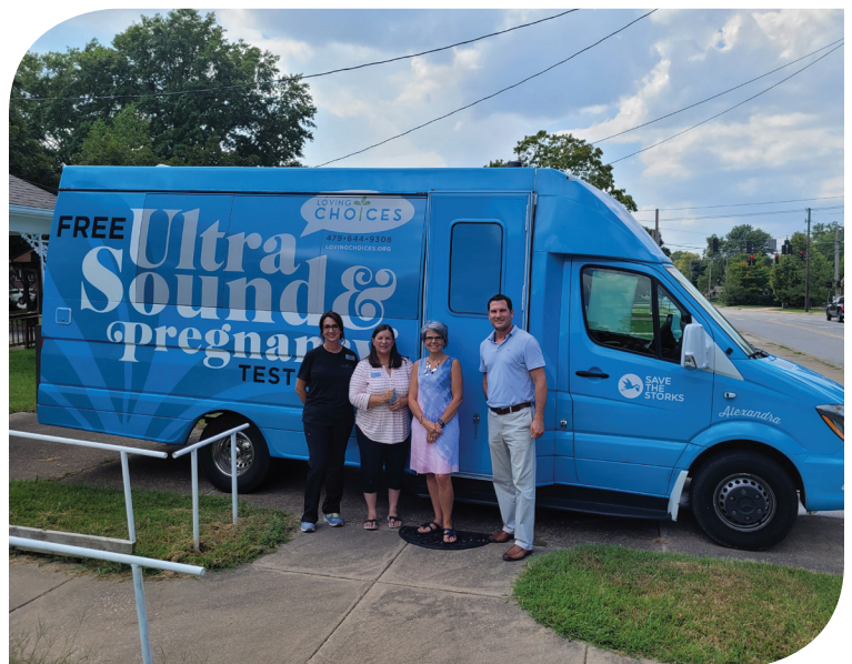
On August 26, two of our team members were able to visit the mobile unit that Loving Choices Pregnancy Centers operates next door to Planned Parenthood’s facility in Rogers.