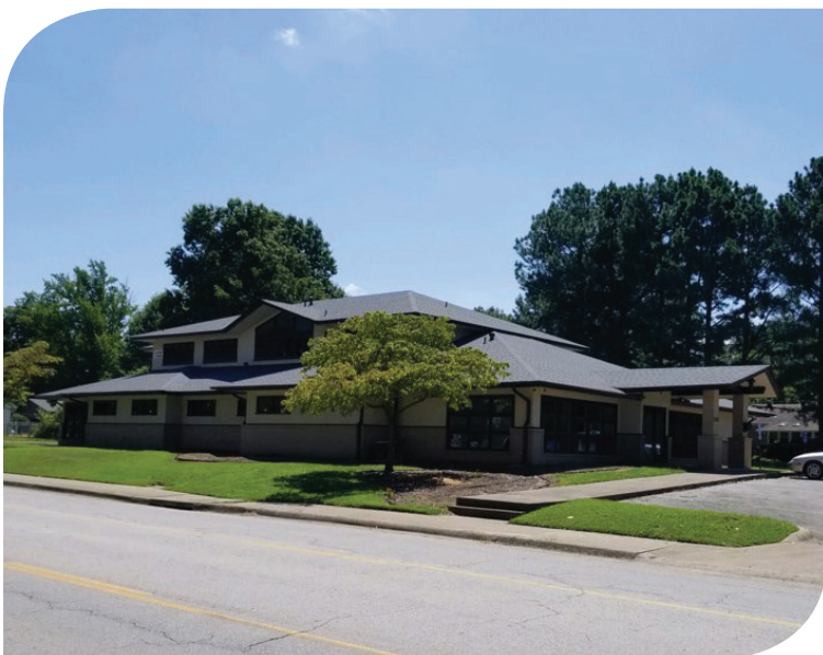
In August Family Council determined that Planned Parenthood had acquired this former medical office on Poplar Street in Rogers.