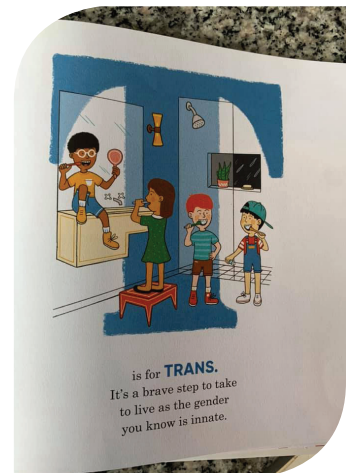
Right: One of the pages from the book The GayBCs displayed in the Jonesboro Public Library last June.