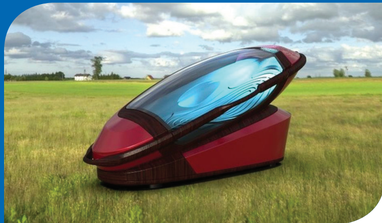
Right: The Sarco Suicide Pod. The capsule fills with nitrogen, killing its user.

The U.S. is winning the fight to end abortion. Nationwide, abortion rates have been in freefall since the 1990s, and states like Arkansas have passed a long list of pro-life measures. We aren’t having the same level of success when it comes to euthanasia and assisted suicide. If we don’t seriously engage on assisted suicide and euthanasia, we may succeed at protecting life at its beginning but fail to protect life at its end.