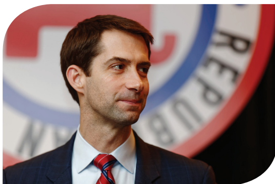
In November U.S. Sen. Cotton (above) sponsored the HEALING Mothers and Fathers Act, a proposed federal law endorsed by Family Council, Arkansas Right to Life, National Right to Life Committee, and Susan B. Anthony List.

Family Council has joined with Arkansas Right to Life, the National Right to Life Committee, and other pro-life organizations in endorsing this good measure. The HEALING Mothers and Fathers Act is similar to Arkansas’ Act 935 of 2021—also known as Paisley’s Law—which the Arkansas Legislature enacted earlier this year. Act 935 provides Arkansans with a $500 income tax credit for the stillbirth of a child at or after 20 weeks gestation. Arkansas also has enacted legislation over the years to de-fund abortionists. We fully support Sen. Cotton’s effort to enact good, pro-life legislation at the national level.