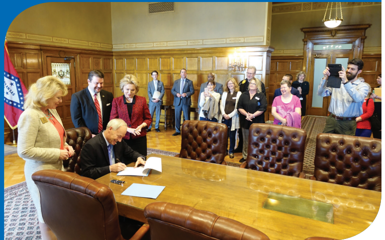
In 2019 Gov. Hutchinson signed a good law prohibiting abortion after the 18th week of pregnancy. It was one of the many pro-life measures enacted during his time as Governor of Arkansas.

I want to wish Governor Hutchinson and First Lady Susan Hutchinson all the best, and I hope our paths continue to cross down the road.