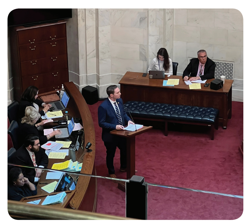
Above: Sen. Tyler Dees presents the Social Media Safety Act requiring parental consent for social media accounts on April 6. Family Council is proud to support this good law.