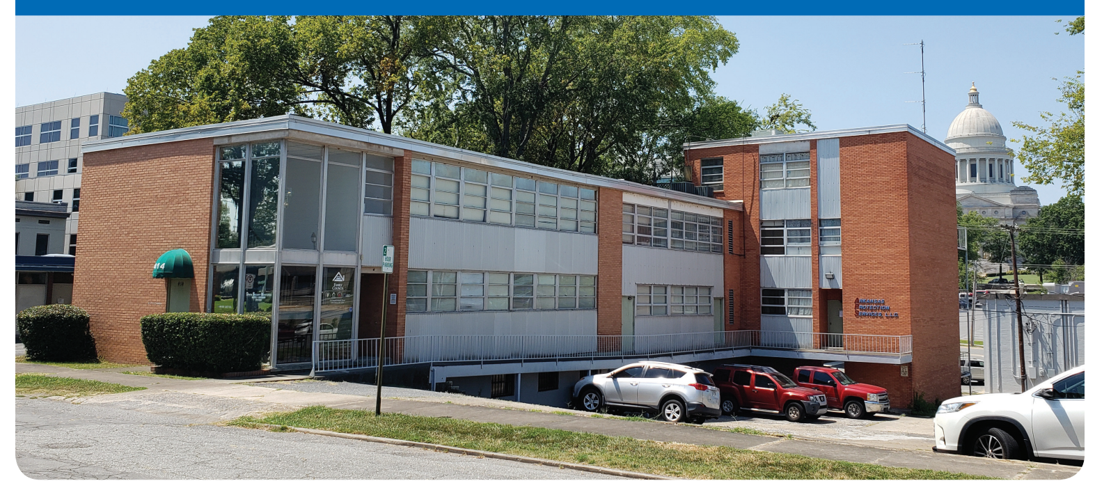
In October Family Council officially purchased our office building on Pulaski Street, just two blocks east of the Arkansas Capitol Building.

I cannot say thank you enough to everyone who gave to our Capital Campaign to help us buy The Family Council Building and grow our staff. Deep gratitude sweeps over me as I think of all the friends who helped us. If you're ever in downtown Little Rock, give us a call, and stop by to say hello. We simply couldn't do this without you.